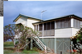
Former Coxswains house whilst on the reserve, 1999.

Number 10-- The Edmondson Family Park Bench marks the location where the family lived in one of the Reserve's 4 original low set timber houses (pictured) the Pilots house was set back a way.