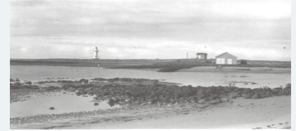
1940/50's Postcard from B & L Somerville collection, preceding the formation of the Burnett Heads Boat Harbour retaining wall. Included with permission of Murray Views Pty. Ltd.

Number 11-- The Boat Shed , an adjunct to the jetty originally faced north, it was realigned to its present position where a ramp with a rail line provided a means to launch the row boat. The pilot launch was moored at the end of the north wall across the river (preceding the formation of the Boat Harbour), thus the smaller boat sufficed for the boatman to row the pilot to the launch to motor out to vessels requiring entry in to the river----