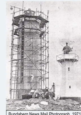
Bundaberg News Mail Photograph, 1971

Today this shed is a base for the Queensland Boating and Fisheries Patrol, Shark Operations Depot. Adjacent is another of the reserves original storage shed's.